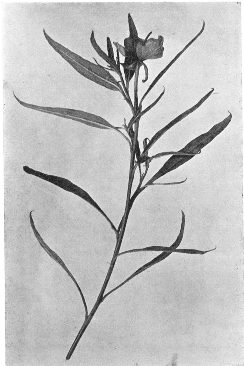
FIGURE 3.— Oenothera suaveolens mut. jaculatrix , Aug. 13, 1915. Flowering side branch of second generation.