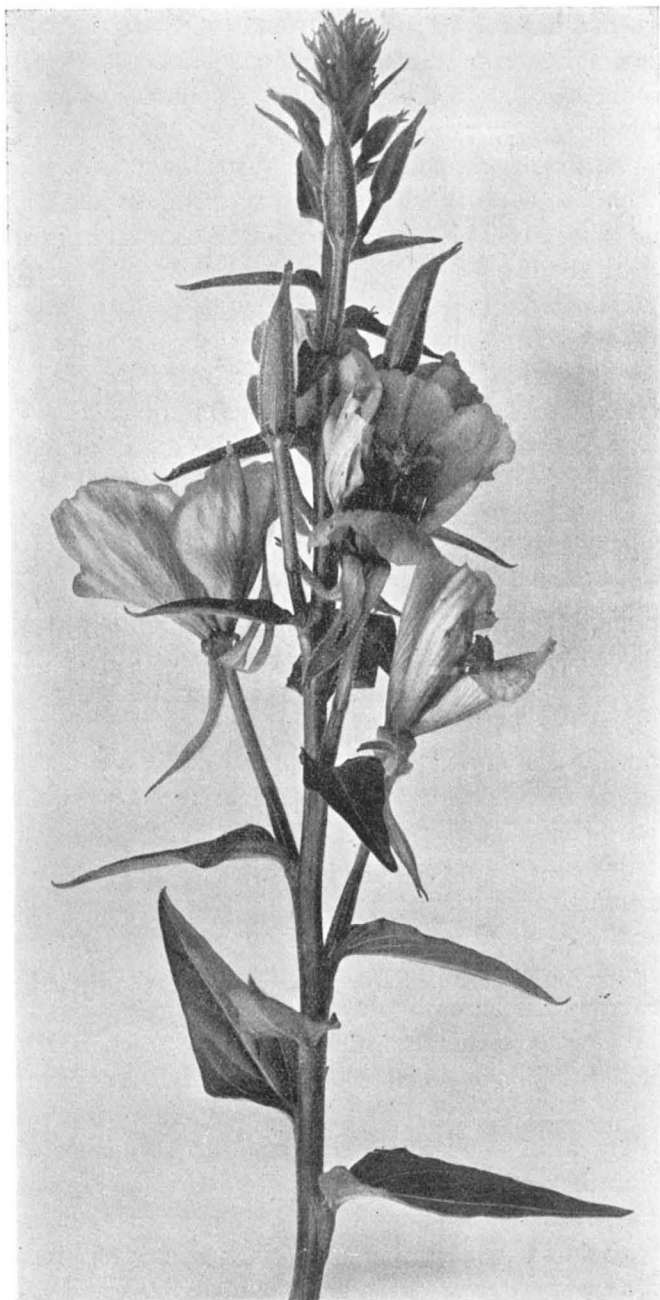
FIGURE 2.— Oenothera suaveolens mut. fastigiata , Aug. 13, 1915, showing the erect position of the flowers. Cf. fig. 4. Mutant of 1915.